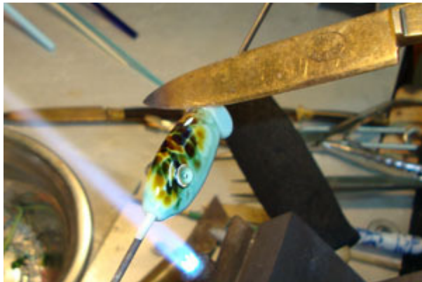
#13- Using the flat side of your knife or shaping tool, gently press the tail toward the mandrel.