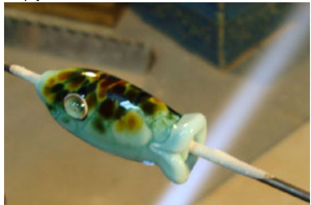
#16- This is the shape you want – and remember to keep flashing your bead in the flame to keep it warm.