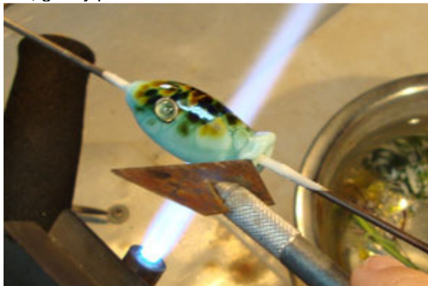
#15- Once you have both sides shaped, you are ready to define the tail. Heat the tail near the mandrel, and using a razor tool or rake, gently pull the tail in towards the body.