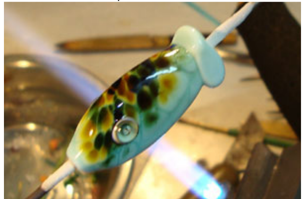
#14- This is the shape you want. Remember to keep your bead warm.