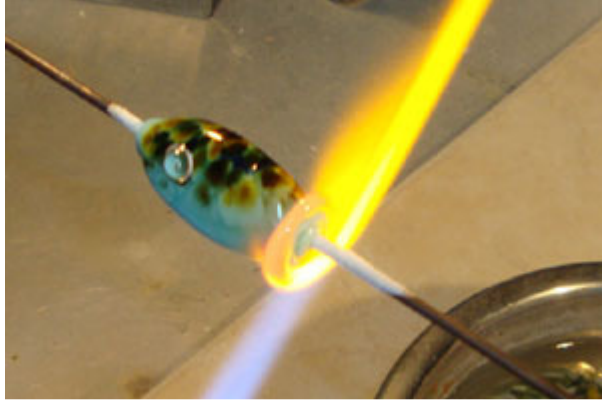
#11- Melt the disk until it rounds up a bit.