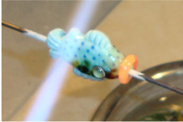
#23- Melt carefully until the lips round out a bit. You can make the lips as large as you want by making the disk larger.