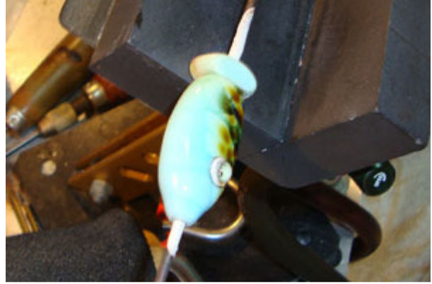
#12- Gently press the disk onto your marver, flattening both sides. You can also use parallel mashers for this step.