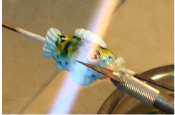
#24- Using a razor tool, nudge the glass toward the bead.