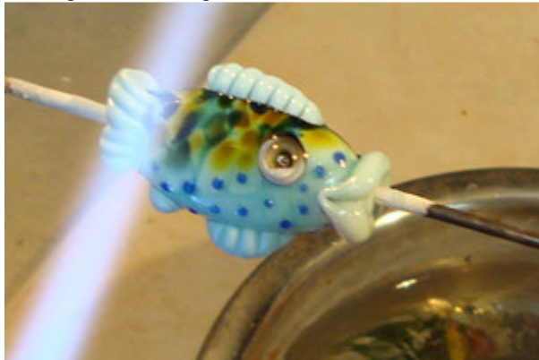
#25- The lips should look like this. Pucker up dahling!