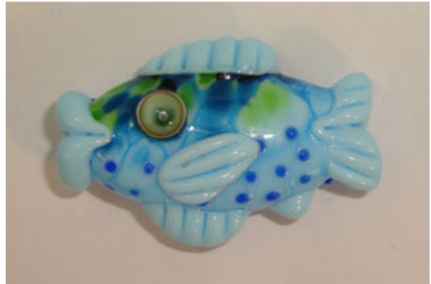
#26- The last step is to add the pectoral fin. To make it simply swipe on a small amount of glass on the side of the fish and, using your razor tool, press grooves into the fin angling up and toward the tail. And your fish is done.